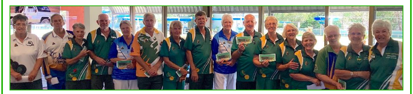
Winners of the prize money donated by Bribie Island Skin Cancer Clinic